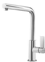
Mixer Tap Omega 8497 000